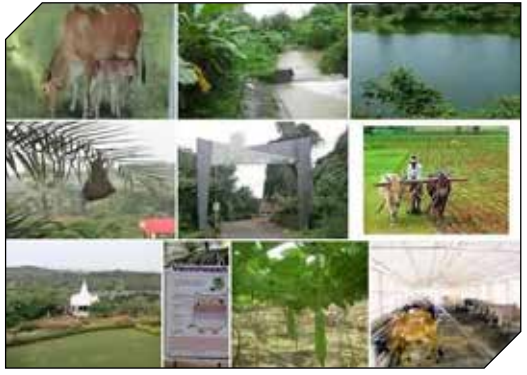
Educational Visit at Department of Sales held on 30th December 2015 at Bhayander (West)